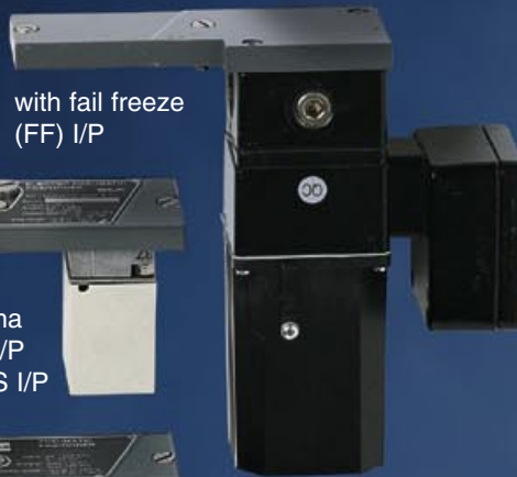
with fail freeze (FF) I/P