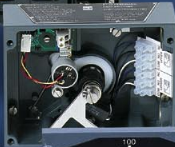
add feedback module at any time (switches and/or 4/20 transmitter)