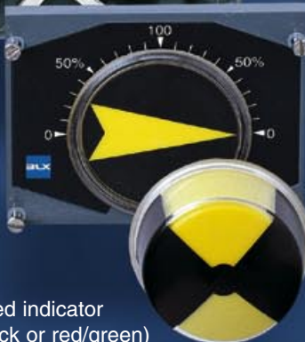
add standard cover with pointed indicator