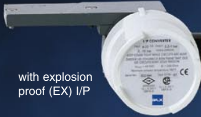
with explosion proof (EX) I/P